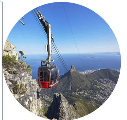
Table Mountain cable car, lunch & sunset Camps Bay beachside